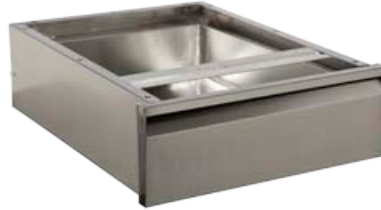
Stainless Steel Drawer Assembly